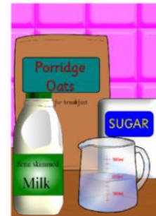
Make and eat some porridge