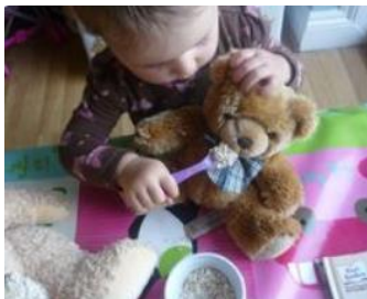
Have a Teddy Bears Picnic