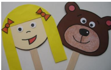
Make lolly stick puppets